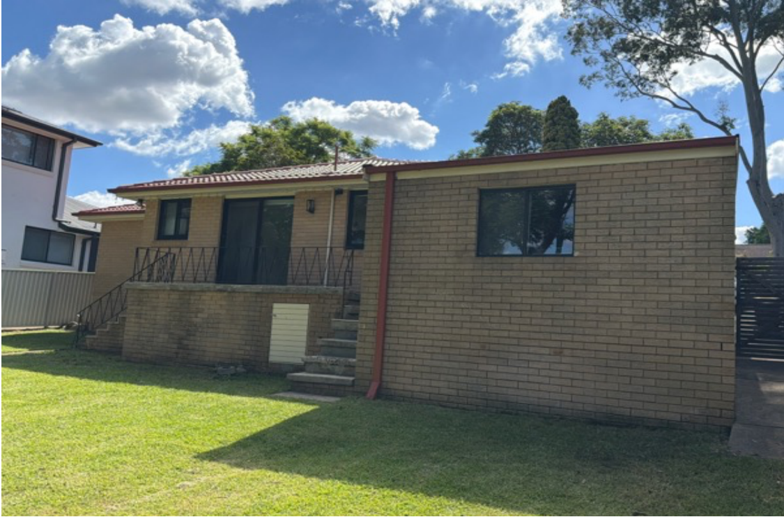
Rear elevation example above.