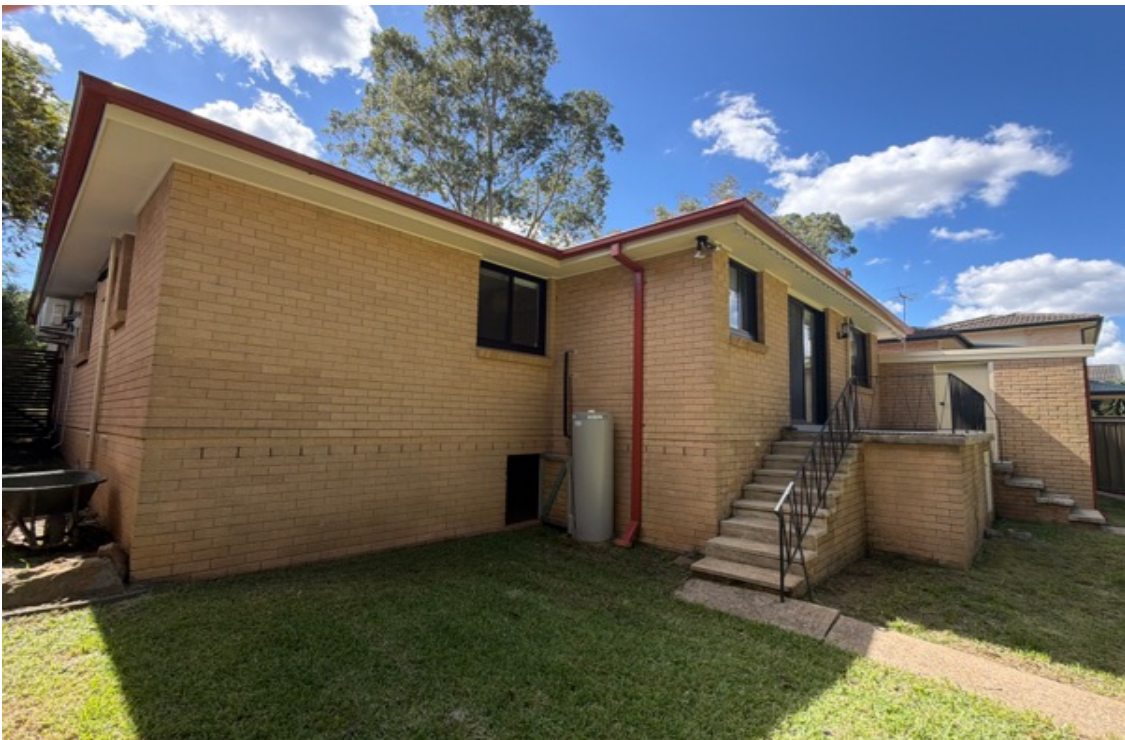
Exterior windows and doors present in satisfactory condition for the age.