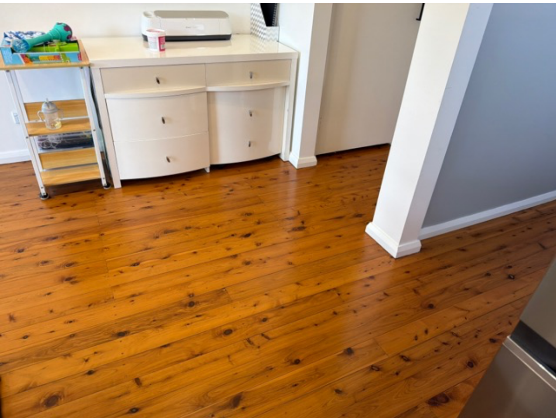
Internal floorboards display low level wear, consistent with age.