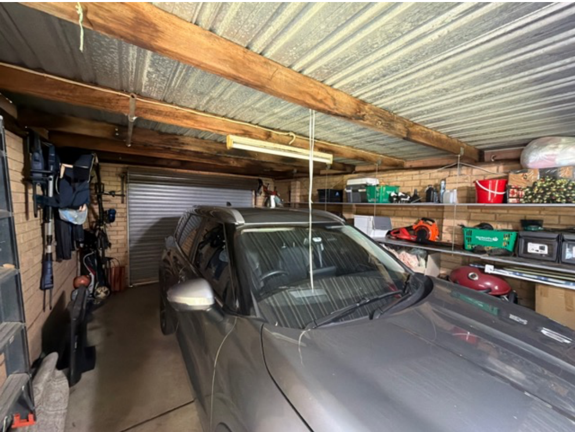
The garage area is in serviceable condition.