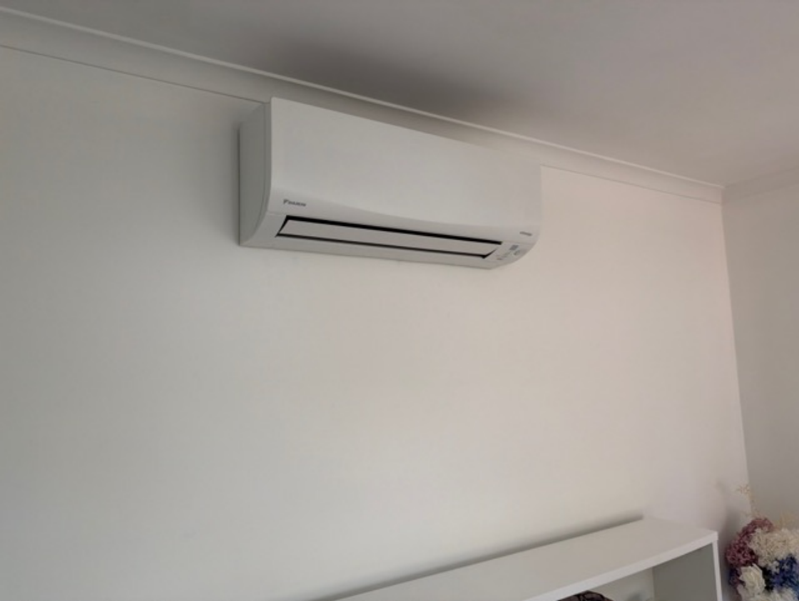
The wall mounted AC tested, functioned at the time of inspection.