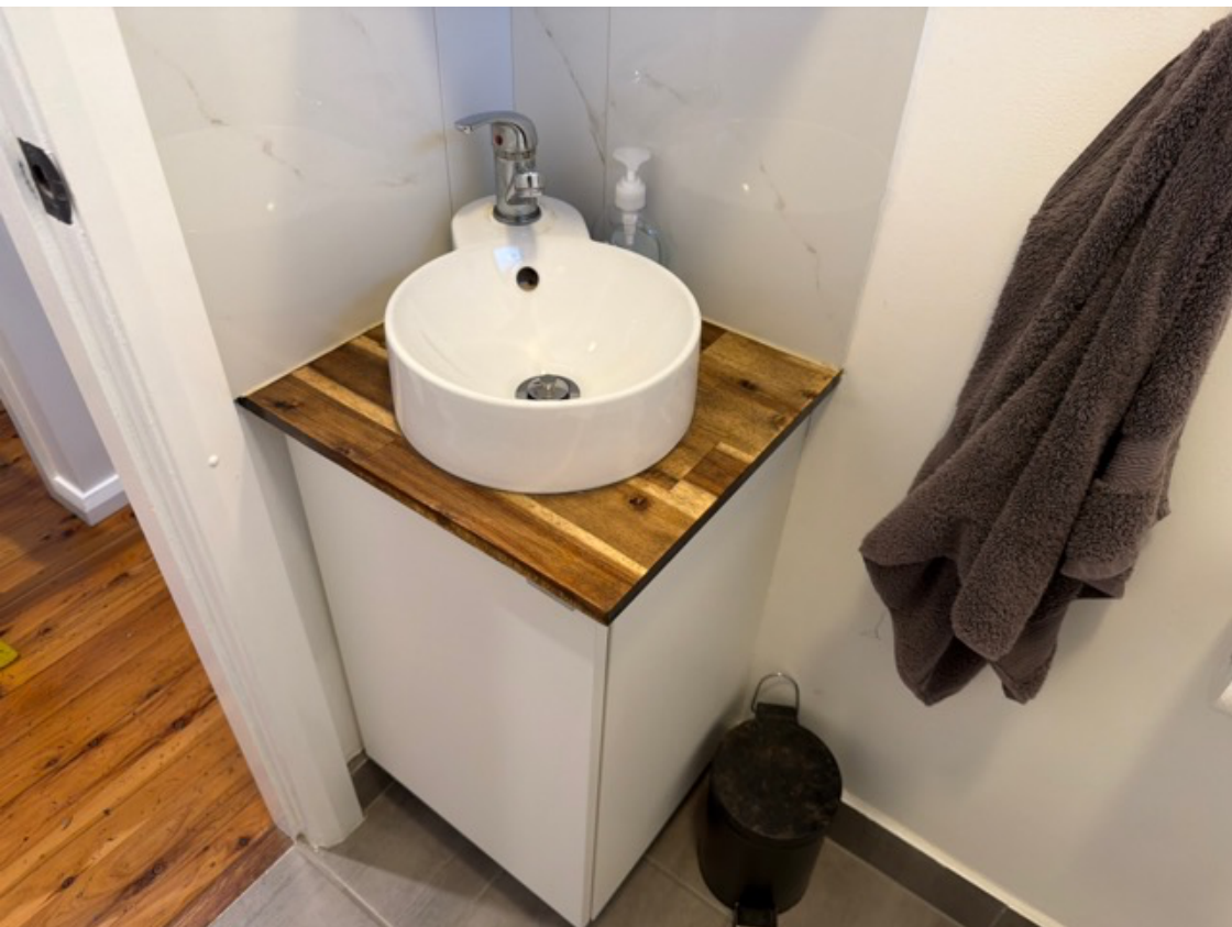
Water pressure tested, is sufficient.