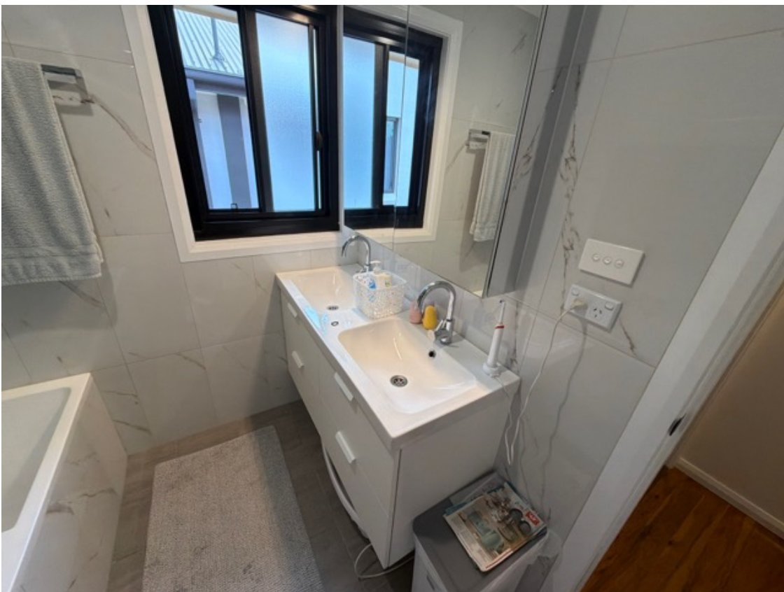
Water pressure tested, is sufficient.