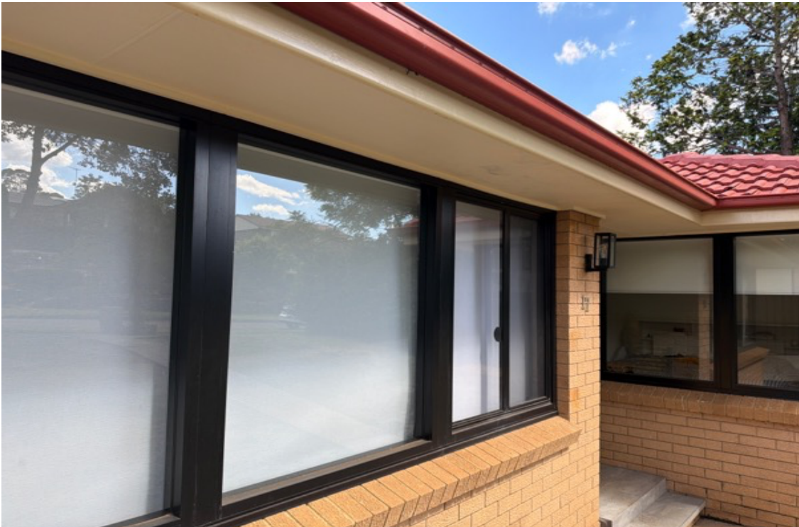
Exterior surfaces display moderate level paint blemishes, consistent with age.