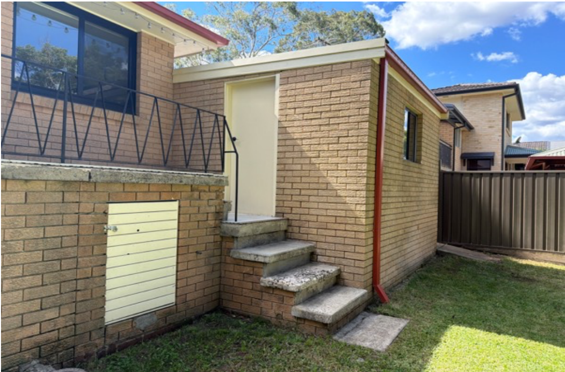
Exterior timber displays moderate level weathering - consistent with age.