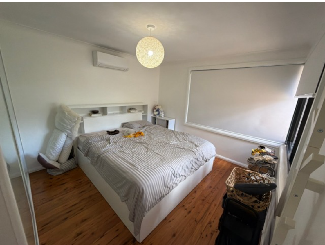
The main bedroom area presents in satisfactory condition for the age.