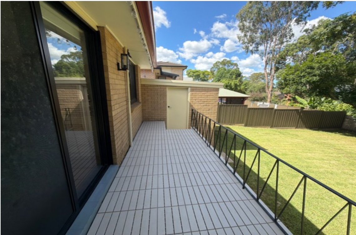
Exterior railings checked are structurally sound.