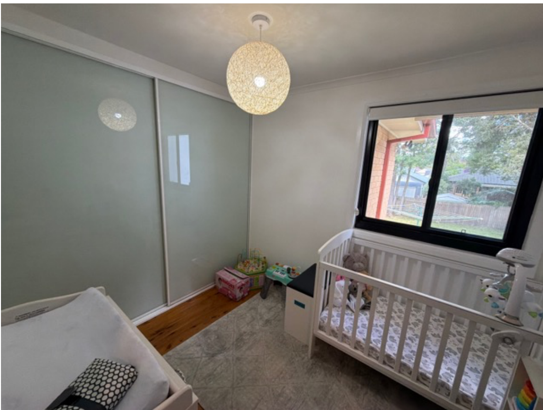
All interior lights tested, functioned as intended at the time of inspection.