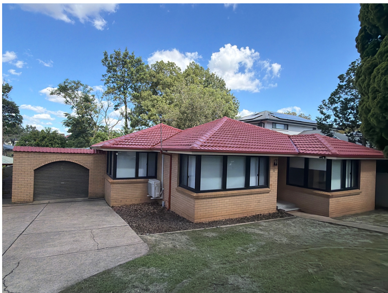
17 SANDERS CRESCENT KINGS LANGLEY.

Front elevation of the Inspected property inspected.