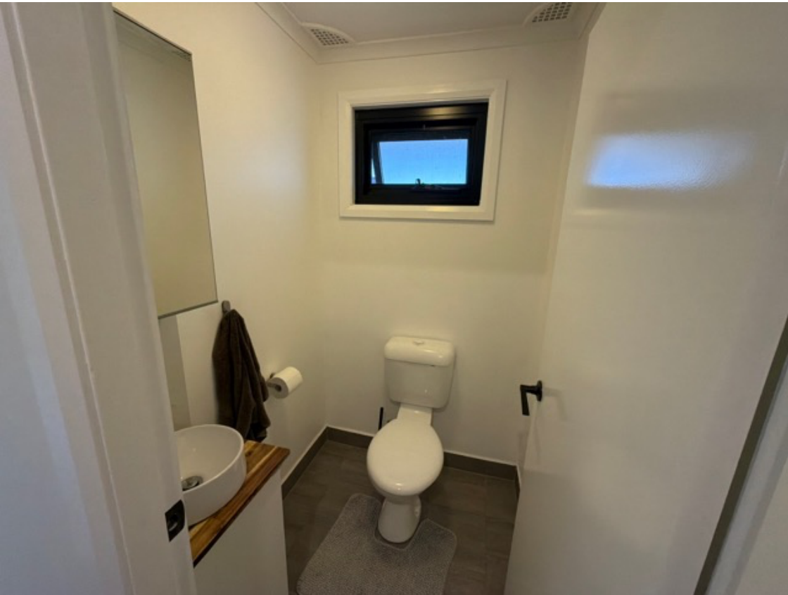
Common toilet area water services tested, functioned at the time of inspection.