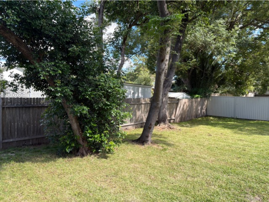
Rear boundary site fences display moderate level weathering and sections are leaning.