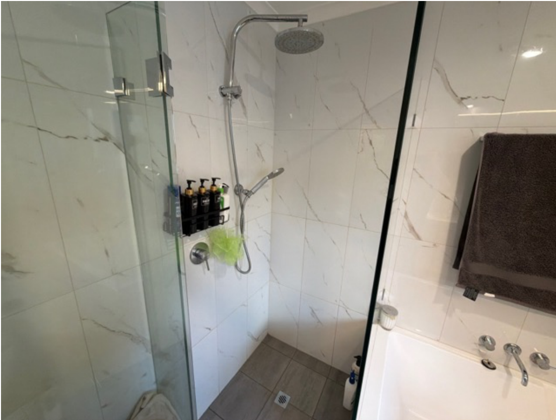
Hot and cold water services tested, functioned at the time of inspection.