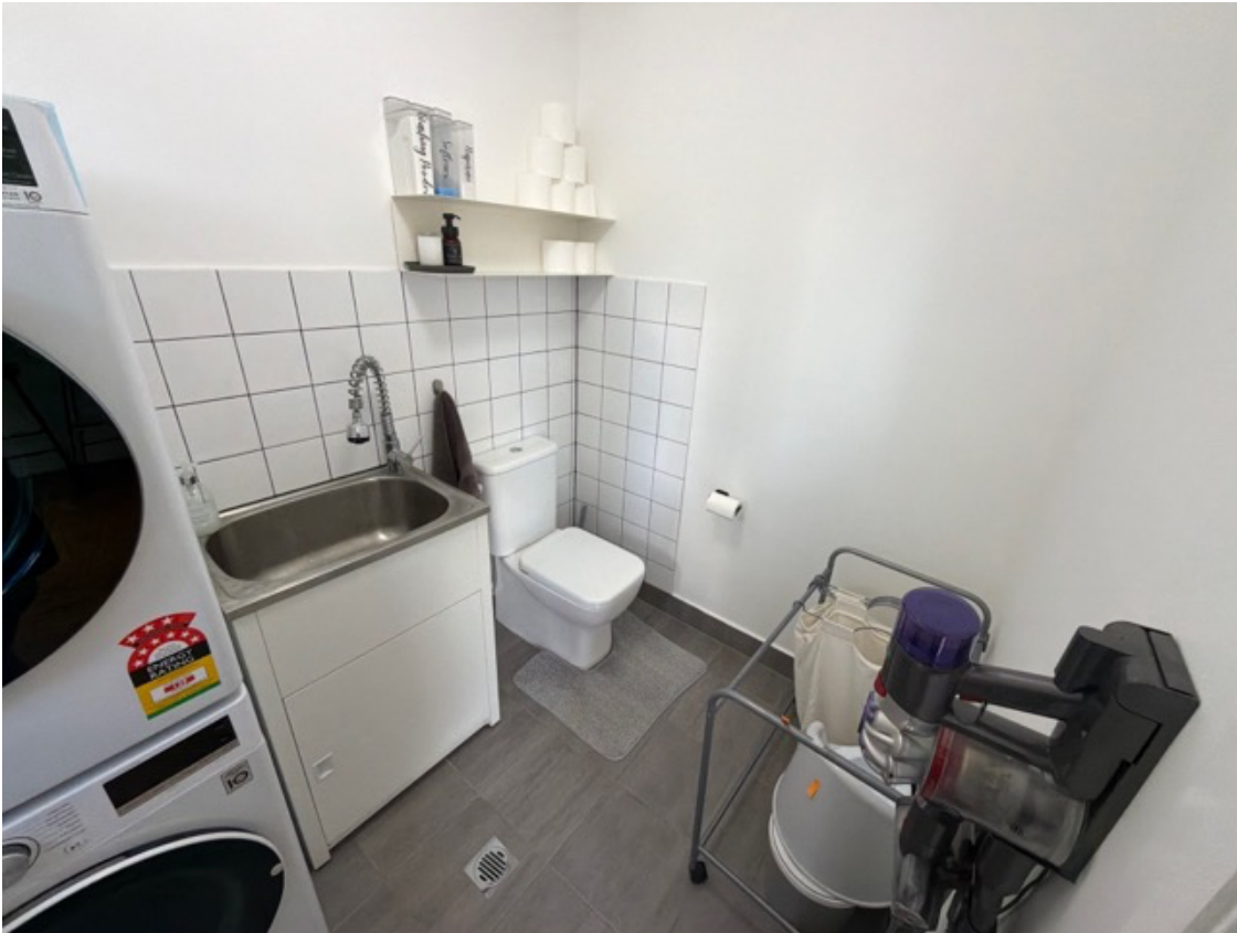
The laundry is in serviceable condition.