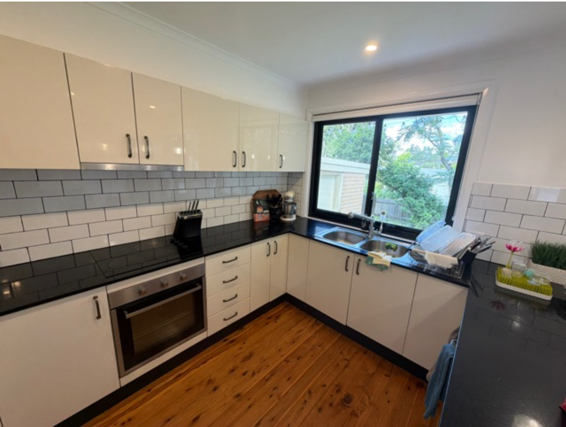
Appliances tested, functioned at the time of inspection.