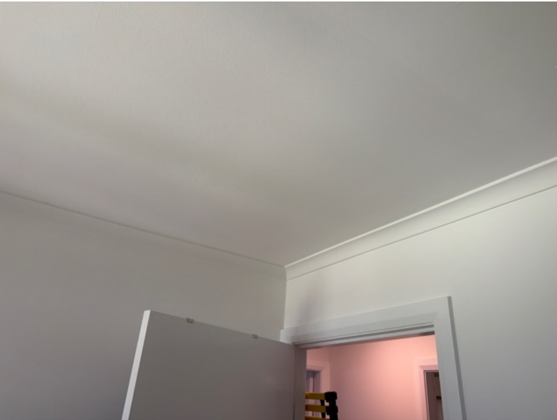
Plasterboard displays minor imperfections (rear mid section bedroom example above.)