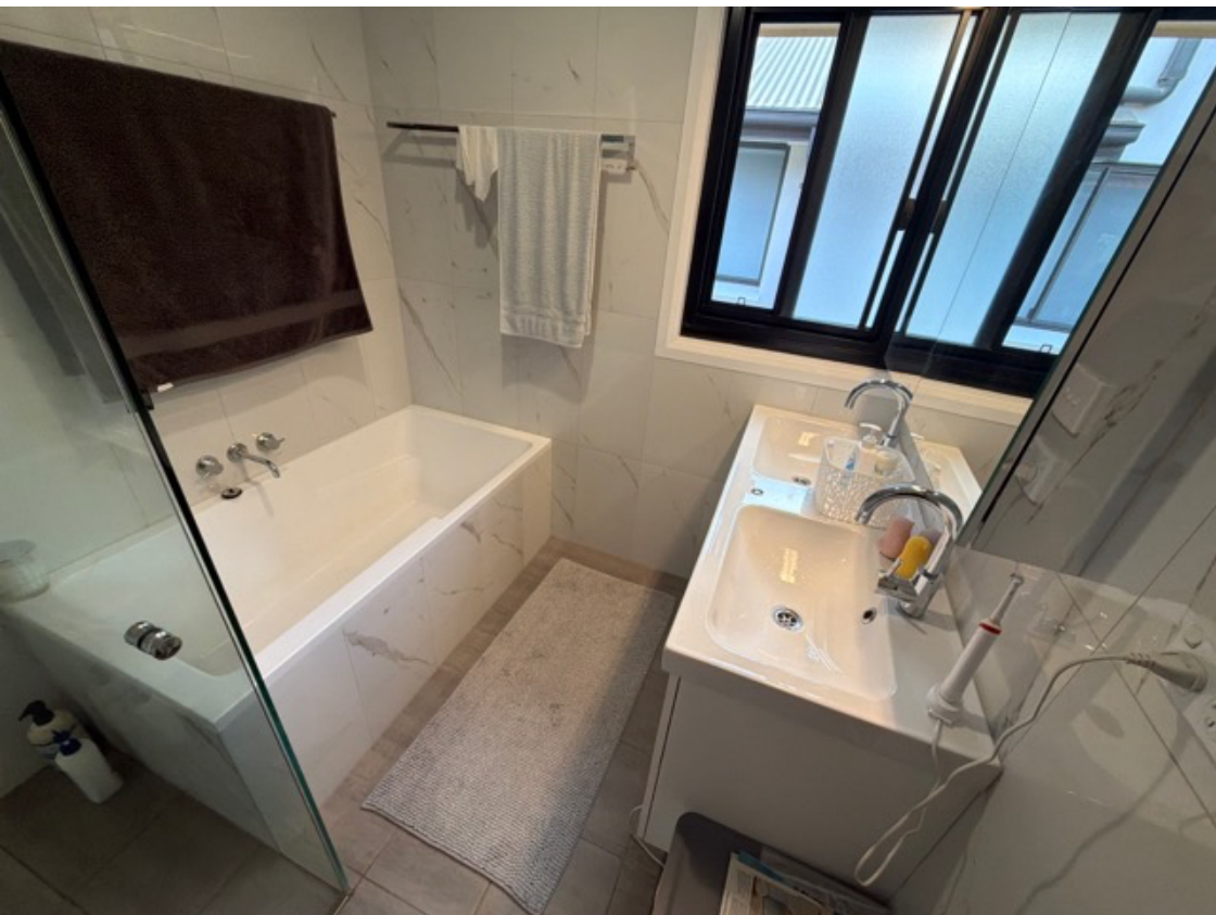
The common bathroom area tested for leaks, was issue free at the time of inspection.