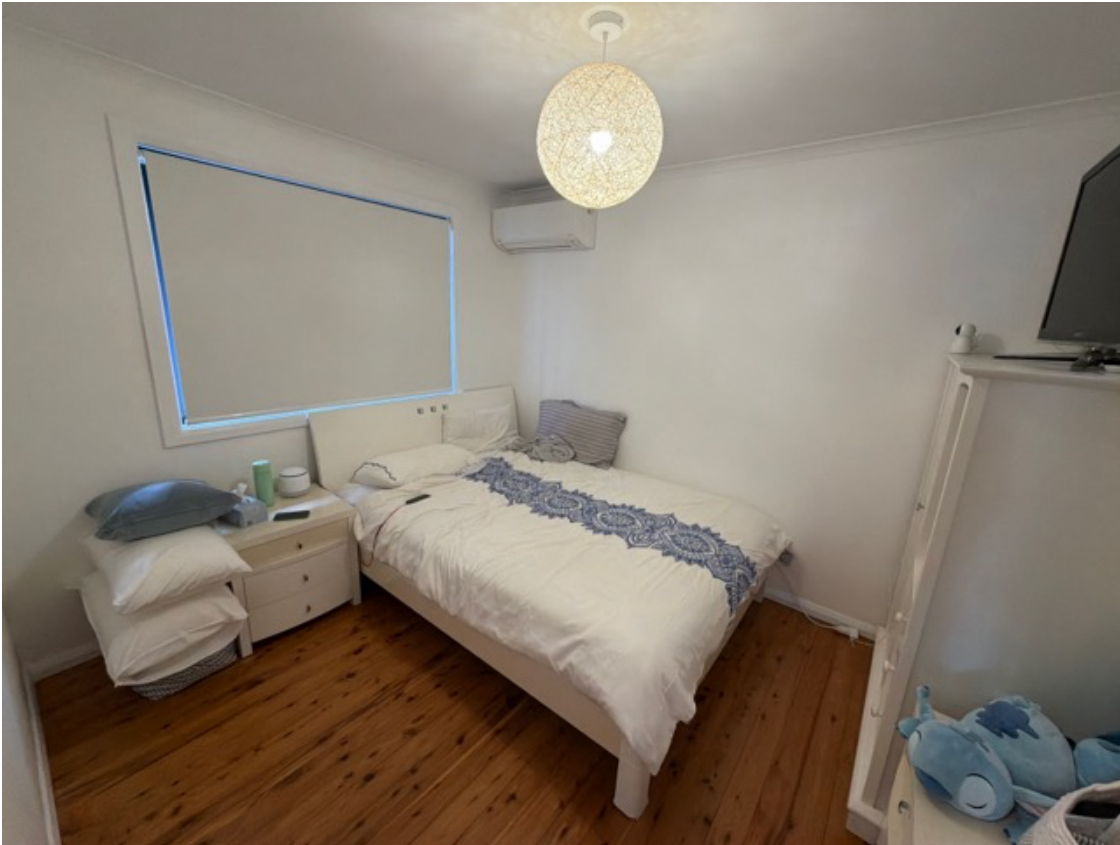
Interior bedroom areas present in satisfactory condition for the age.