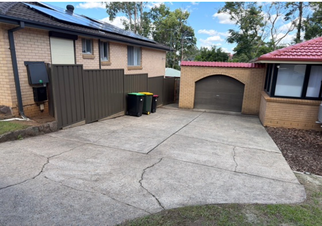
Exterior concrete presents in serviceable condition for the age - isolated sections are cracked and undulating (consistent with age.)