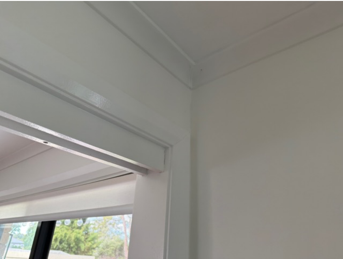
Plasterboard and cornices are cracking (hairline, laundry example above.)