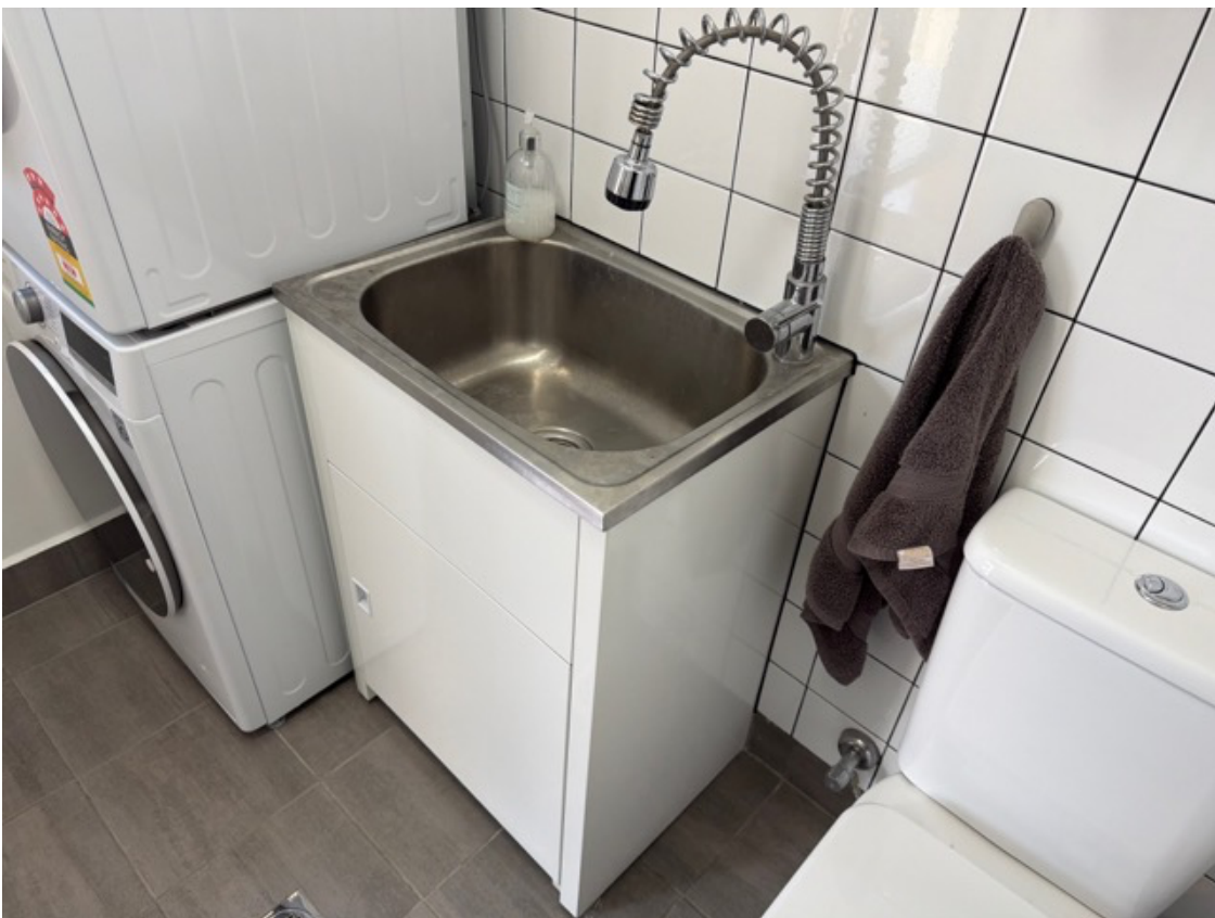
Water pressure tested, is sufficient.